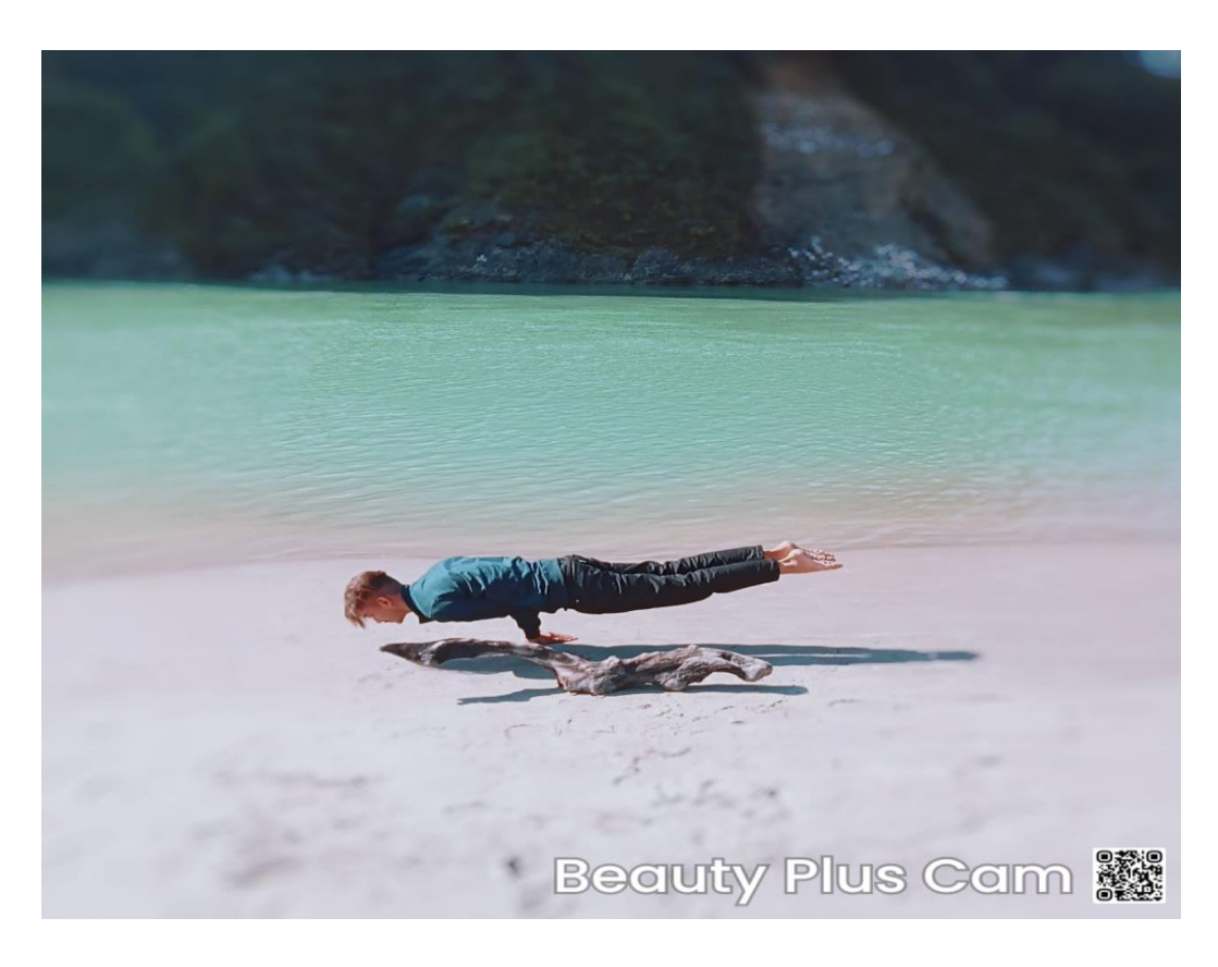
10. Last day of the tour, visited to Shantikunj Gayatri Parivar, there students learned Ayurveda, Modern Pharmacology, Integration, Research, Future the Mantras, and the methods of Yagya